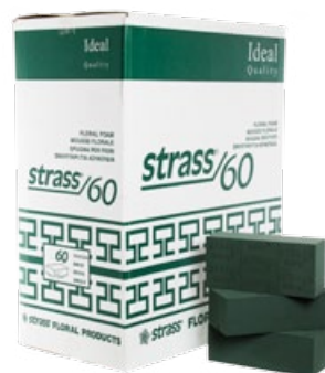
Strass 60's - 1002ST60