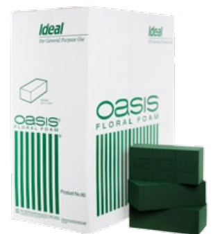
Oasis 60's - O60B