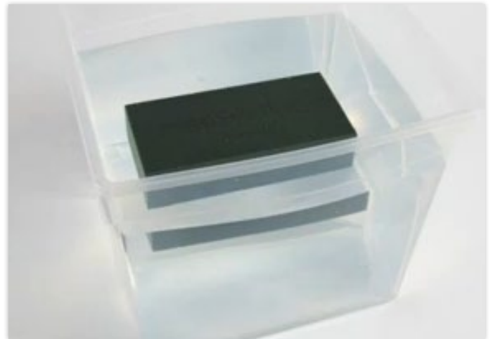
Completely soaked foam will be dark green and

As the foam soaks up water, you will see the colour change from a light green to dark green. When it is fully charged with water it will weigh considerably more than when you placed it in. When the foam piece has completely changed colour and is swimming on the water you can remove it from the water.