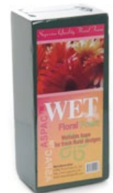
Strass Brick - WB1

“Buy your bricks in bulk and save. Single packed bricks are also available.”