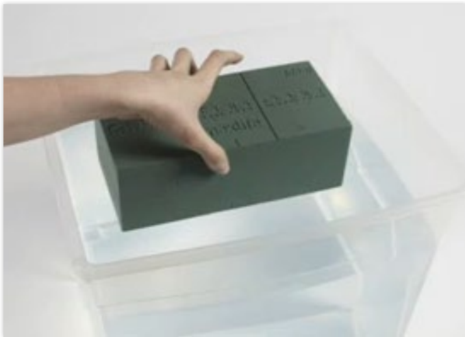
Place the foam flat onto still water.

Start with a good quality foam as cheaper foam will not soak up water as evenly throughout and will result with dry pockets which will cause flowers to die prematurely. Make sure that your water container is larger than the piece of foam and is filled with enough water to completely submerge the piece of foam.